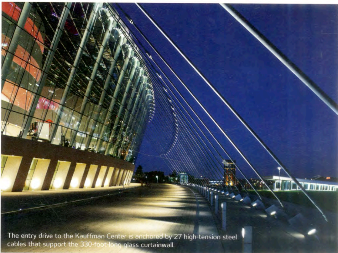
The entry drive to the Kauffman Center is anchored by 27 high-tension steel cables that support the 330-foot-long glass curtainwall.