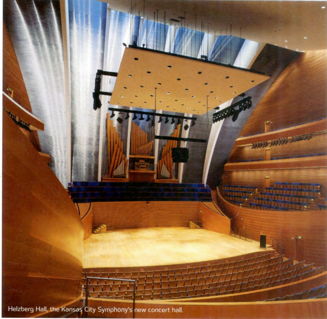
Helzberg Hall, the Kansas City Symphony's new concert hall.